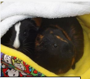
Adoptees Kiwi and Strawberry try out their new cuddle cup at our Supply Day Fundraiser.