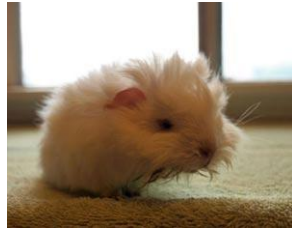
A 5-week old lethal recently born to our rescue. (You can read more about

lethals here http://www.guinealynx.info/eyes.html#congenital )